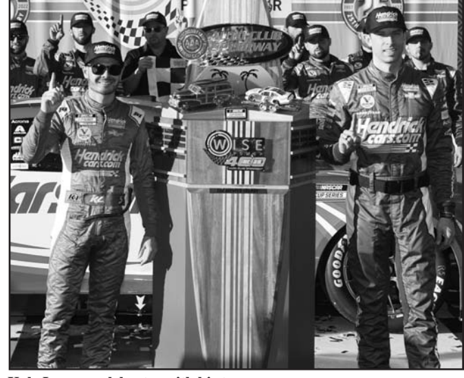
Kyle Larson celebrates with his team.