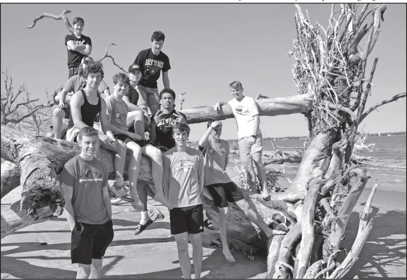
The Indians basketball team made a stop at Jekyll Island during last week's Sweet-16 trip to Charlton County.